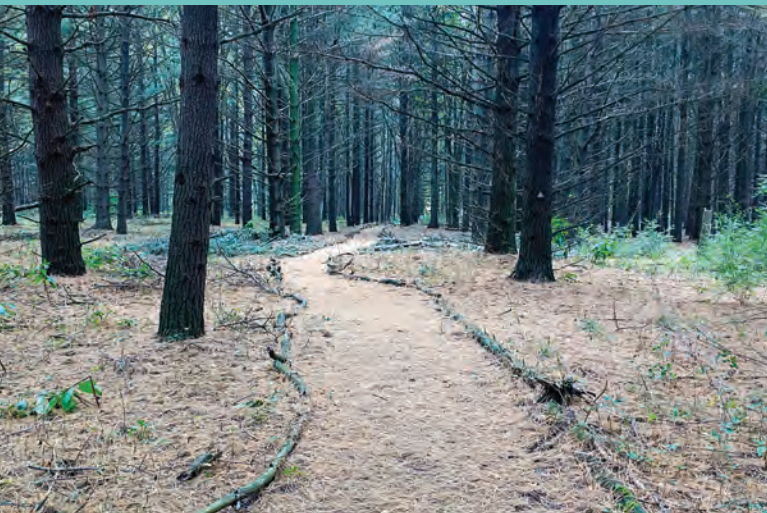
Soft pine needles underfoot